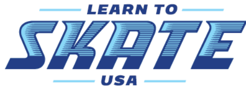
ILLUSTRATION OF THE PROGRESSION THROUGH THE LEVELS OF U.S FIGURE SKATING

Singles athletes begin with the Learn to Skate USA program, then progress to the "introductory levels," and finally choose whether to follow the test track or Well Balanced program category. Athletes may choose to move between test track and Well Balanced program at any point.